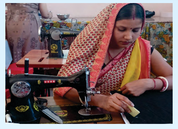
Counselling Sessions by Logistics sector skill council to discuss about job opportunities available for women in Logistics sector

More than 2585 women have been trained through our training programs. They have been certified after qualifying in the exams. Have also given them procurement orders for hand- made bags for our customers during Auto Expo.