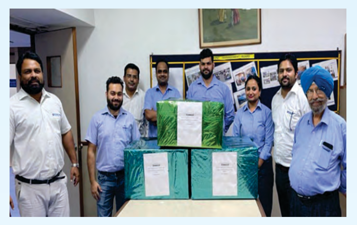
Patiala Team with the commodities to be distributed in collaboration with Goonj.

Campaigning Locations were Gurgaon, Bhiwadi, Parwanoo, and Patiala.