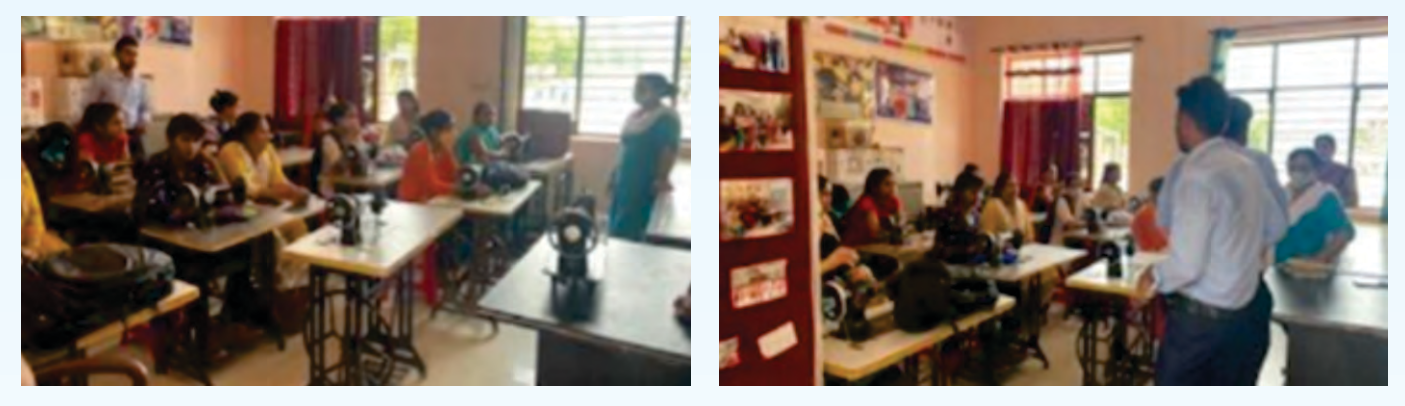
Workshop on Sewing Machine maintenance