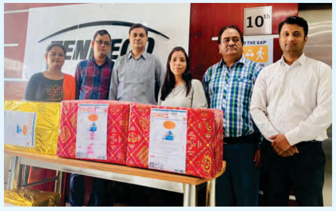
Gurgaon : As a Socially responsible organisation, Tenneco is committed for giving back to society in terms of uplifting and empowering the needy and underprivileged sections of society. As a part of CSR